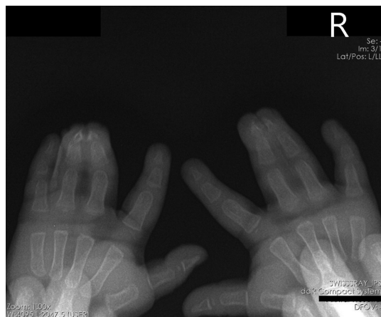
FIGURE 2 Radiographic image from both hands, confirming a complex bilateral and symmetrical syndactyly in the neonate

had been previously diagnosed as a case of pituitary macroadenoma and was prescribed cabergoline 0.5 mg orally twice a week by an endocrinologist for 6 months including the first trimester of the pregnancy. Since cabergoline has been reported to be associated with gestational abnormalities in previous studies and case reports and there were no other important underlying chronic disorders, deleterious habitual behaviors, or serious medical consumptions (limited to famotidine and ondansetron tablets prescription), it is greatly concludable that the exposure to cabergoline during the first trimester may be the main etiology underlying development of syndactyly in the male toddler of the present study.