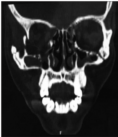
Figure 1: Preoperative computed tomography (CT) showing orbital floor fracture with herniation of contents

Five patients [Table 1] with orbital floor defects of medium size average 1.16 cm size (range 0.8-1.5 cm) were grafted by using autogenous bone graft harvested