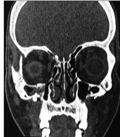
Figure 5: Postoperative CT showing consolidated bone graft at orbital floor

The basic objective of reconstruction of orbital defect is to restore orbital volume, function, and esthetics. [6] Orbital floor reconstruction has been achieved using a wide variety of materials which includes cartilage and fascia homograft (autogenous bone graft (Converse, et al. , 1961), and alloplastic materials (Borghouts and Otto, et al. , 1978). Autogenous graft is a well-established and relatively successful method of repairing orbital defects. [7] Very few cases of use of anterolateral wall of maxilla as a bone graft for reconstruction of orbital defects has been reported in the literature.