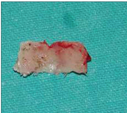
Figure 3: Photograph showing harvested anteriolateral wall of maxilla