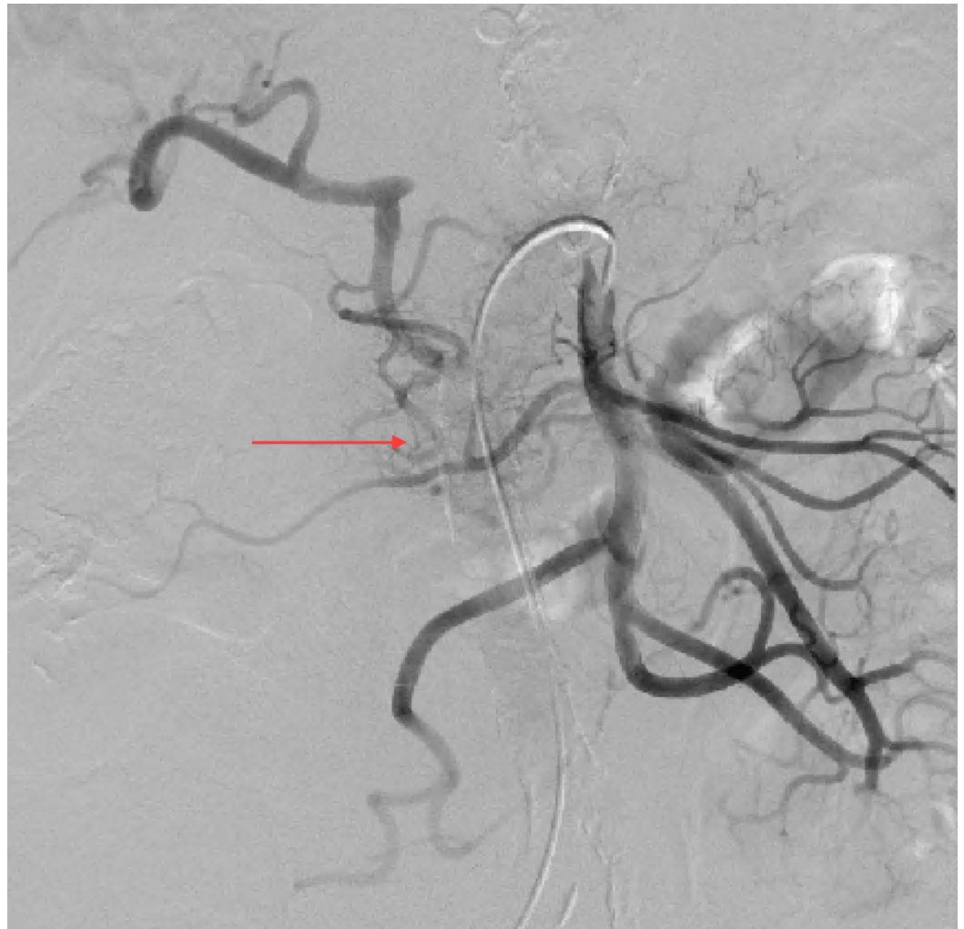
FIGURE 3: Aortogram with superior mesenteric arteriography demonstrating reconstitution of the proper hepatic artery via retrograde flow in the gastroduodenal artery

Due to the distal reconstitution of retrograde flow into the GDA from the SMA, and left gastric artery coming off of the splenic artery distal to the origin of the aneurysmal common hepatic artery, the patient was taken to the operating room for open HAA repair. An upper midline laparotomy was performed. The stomach was found to be displaced inferiorly secondary to the aneurysm. The hepatic artery was found to be aneurysmal while the celiac, splenic, and left gastric arteries were of normal caliber. The celiac, splenic, and left gastric artery were isolated and controlled. The distal aspect of the aneurysm was palpated and found to be thrombosed. The celiac artery was clamped, and an arteriotomy was made which created an opening of the aneurysmal sac where significant amounts of mural thrombus were found and evacuated. Afterward, the aneurysmal common hepatic artery was isolated and the celiac trunk was reconstructed with pledgeted prolene sutures. Finally, arterial blood flow through the splenic, left gastric, and both left and right hepatic arteries was confirmed using intraoperative Doppler.