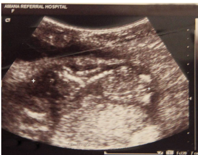
Fig. 1. Abdominal ultrasound: cramped fetal parts with oligohydramnios.

On July 29th 2015, the patient suddenly developed intensified abdominal pain, her blood pressure fell to 80/40 mmHg and hemoglobin of 6.5 g/dL. Emergency laparotomy was performed. Under general anesthesia, a midline incision above the umbilicus was made. On opening the abdomen, about 1,500 mL of blood associated with clots was found and removed from the peritoneal cavity. The placenta was attached between the anterior and posterior leaves of right broad ligament and also implanted over right adnexal and ileocolic region. The right fallopian tube and ovary were severely distorted which is highly suggestive of a tubal pregnancy that ruptured and resulted in secondary implantation in the peritoneal cavity, and they were neither well visible because