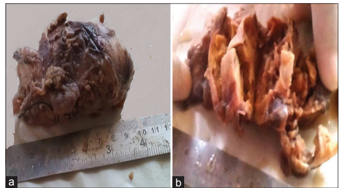
Figure 2: Gross images show (a) A well-circumscribed mass with intact capsule (b) cut-surface shows cystic change with extensive necrosis