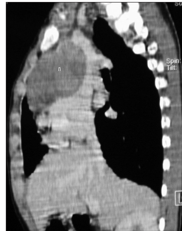
Figure 1: Computed tomography chest showing a large, lobulated, homogenous soft tissue anterior mediastinal mass (marked T). Fat planes with the superior vena cava, brachiocephalic vein and pericardium are maintained

The most widely used thymoma classification is the Masaoka staging system which is based on the presence of invasion into surrounding organs, completeness of resection, association with myasthenia gravis, tumor size, and involvement of great vessels, to determine postoperative survival. [6,7] The WHO system, based on the morphology of epithelial cells as well as the