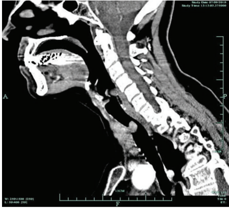
FIGURE 1: CT scan of the neck and mediastinum which revealed a mass originating from the thyroid gland, invading and severely obstructing the lumen of the trachea.

allergic asthma, and, spontaneously, she complained of sore throat and mild haemoptysis. Clinical examination revealed scattered wheezes from the lungs without any abnormal findings from the pharynx. Spirometry showed a typical obstructive pattern, attributed to asthma. Her medical history was remarkable of subclinical hypothyroidism, adequately treated with levothyroxine.