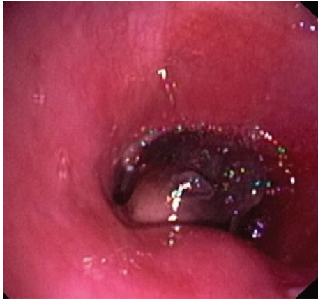
FIGURE 3: The bronchoscopic image revealed the extensive intraluminal growth of the mass.

reactions, chemical respiratory burns, infections such as croup, epiglottitis, and other viral or bacterial diseases, as well as peritonsillar and retropharyngeal abscesses, throat cancer, and foreign bodies. Thyroid cancer, although rare as a cause of UAO, should also be considered [7]. In our case, there was no medical history, or other evidence, suggestive of PTC. Symptoms of airway obstructive disease had existed several years before and gradually increased during the last 3 years. These symptoms were initially attributed to asthma and were managed accordingly; the partial relief of the obstruction with medical therapy led to a delay in diagnosis.