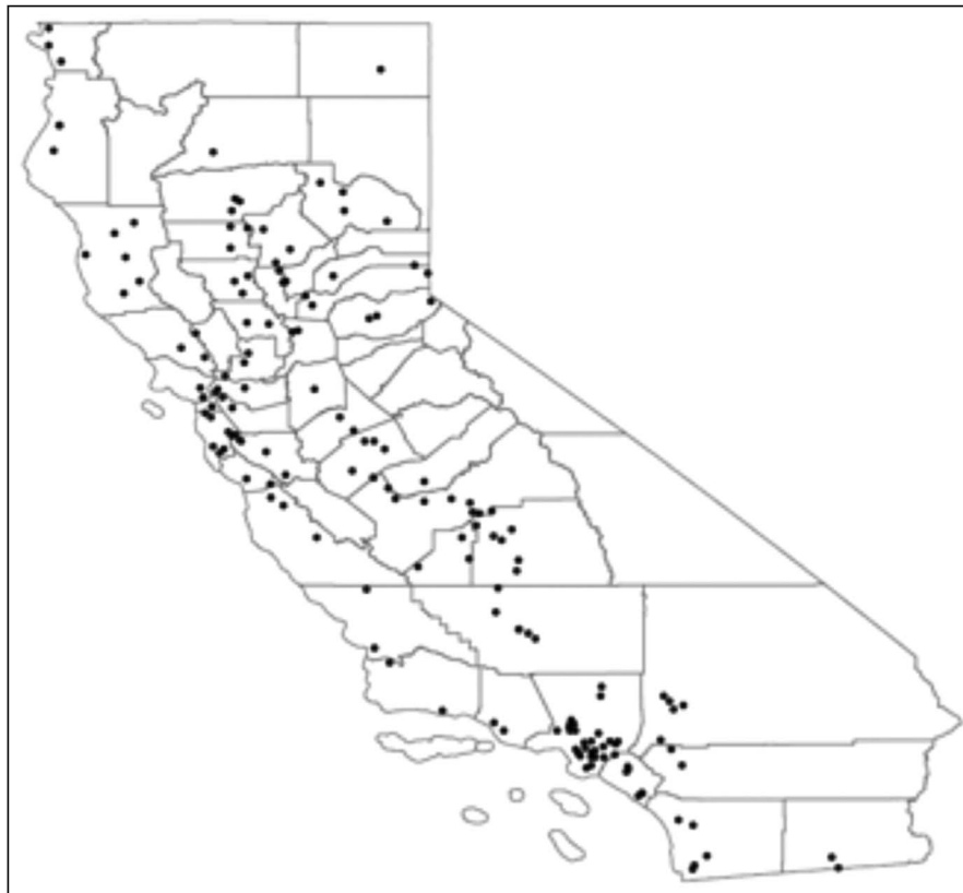
Fig. 1 Locations in which stores included in the CX 3 (Communities of Excellence in Nutrition, Physical Activity, and Obesity Prevention) sample are situated; cross-sectional statewide survey in low-income neighborhoods in California, 2011–2015

In the sampled stores, the average recorded lowest prices for fruits and vegetables were lowest in large grocery stores for four of the items recorded (apples, bananas, carrots, broccoli) and lowest in small markets for three (oranges, tomatoes, cabbage; Table 3). Convenience store