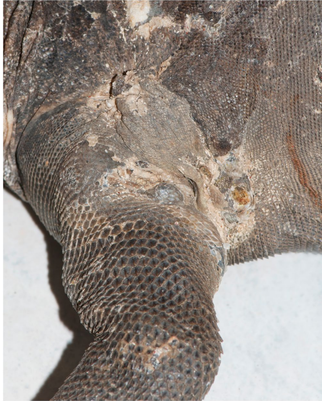
Figure 1. Devriesea agamarum associated dermatitis and cutaneous granulomas in the axillar region of a free-ranging Lesser Antillean iguana ( Iguana delicatissima ).

Skin disease in lizards can be caused by a variety of pathogens. In captive lizard populations dermatologic disease is routinely observed and is primarily a consequence of substandard husbandry and underlying disease, facilitating the onset of secondary skin infections 7 . A few bacterial and mycotic agents on the other hand are considered as primary pathogens towards the development of skin disease and may eventually eradicate entire captive lizard collections 8,9 . Over the past decade, several emerging fungal diseases have led to large-scale declines and extinction events in wild ectothermic host populations 2,4,5 . Outbreaks of bacterial infections causing high morbidity in free-ranging populations of reptiles, however, are extremely rare and mostly limited to respiratory infections in chelonians caused by Mycoplasma species infection 10,11 . Herein we report the association of Devriesea agamarum infection with skin disease in a free-ranging population of Iguana delicatissima on Saint Barthélemy.