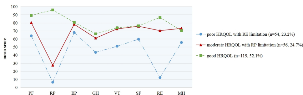
Figure 1 The predicted mean HRQOL for each trajectory group.

The findings of the intergroup comparison analysis demonstrated statistically disparities ( p < 0.05 ) in the three groups of HRQOL among AA patients in terms of household annual income, having children or not, ECOG-PS score, comorbidity, transfusion-dependence, AA-related symptoms, and time since diagnosis (Table 3).