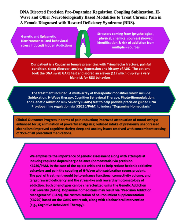
Figure 3. Coupling DNA, Subluxation Repair, H-Wave and Pro-Dopamine regulation in a diagnosed Reward Deficiency Syndrome female patient.

To help us understand this complex protocol, Figure 3 presents a schematic model of these results.