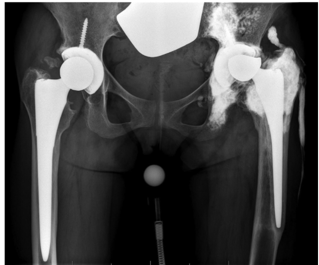
Figure 1. Preoperative anteroposterior radiograph of the hips from June 2017 demonstrating a diffuse sclerotic reaction extending into the soft tissue along the proximal aspect of the thigh, an aspherical femoral head likely due to chronic superior erosion, a loose femoral component in valgus, and a loose acetabular cup.

The patient underwent revision THA of the left hip using a posterolateral approach in September 2017. After dislocation of the femoral head, the femoral stem was found to be loose and easily removed. Intraoperative findings demonstrated flattening of the femoral head caused by probable dissociation of the liner and erosion of the femoral head on the metallic rim of the acetabular