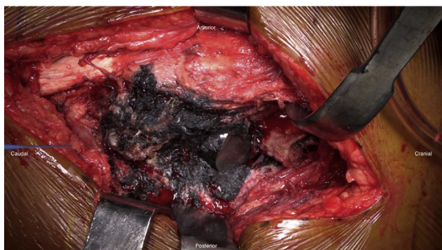
Figure 4. Intraoperative image showing abundant metallosis and a flattened femoral head.

At the patient's latest follow-up, her groin pain had resolved, leg-length discrepancy corrected, range of motion improved, and she was transitioned from a rolling-walker to a single-point cane. Radiographic imaging demonstrated no evidence of hardware complications; however, there was persistent metallosis involving the surrounding soft tissue consistent with prior radiographs (Fig. 5).