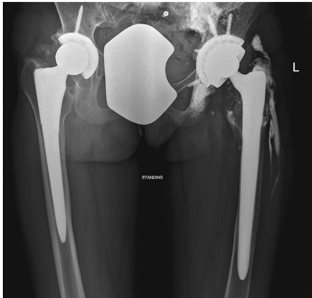
Figure 5. Anteroposterior radiograph of the pelvis at latest follow-up demonstrating no evidence of hardware complication and diffuse metallosis involving the surrounding soft tissue and bone.

Other described etiologies of Oxinium femoral head failure include third-body wear, ceramic liner pairing, and PE liner compromise [37,38]. Tribe et al. [39] described a case of a cracked PE liner, allowing direct articulation of an Oxinium head with the acetabular cup, leading to accelerated femoral head wear.