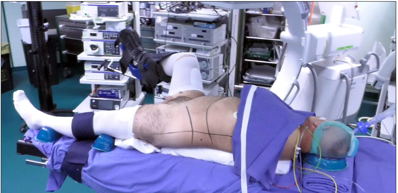
Figure 1. Giusti modification of Valdivia-Galdakao position.

Prospective data were collected for all HSK patients who underwent supine PCNL at our institution from June 2016 to June 2023. The study was approved by the local ethics committee and patients provided