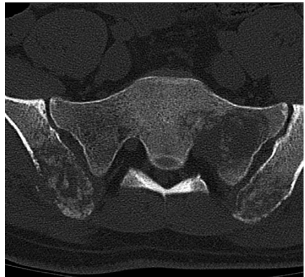
Figure 3: Iliac crest metastasis.