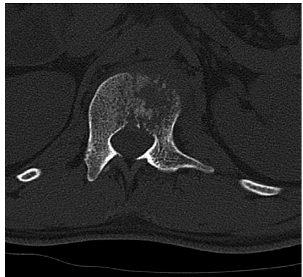
Figure 4: L1 metastasis.