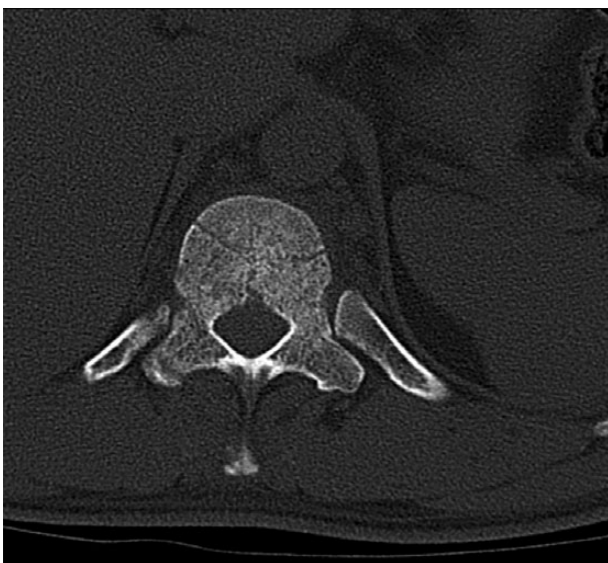
Figure 2: T11–T12 metastasis.