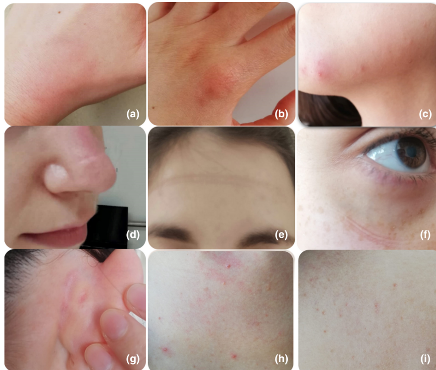
FIGURE 1 Examples of the most reported skin lesions caused the use of masks, gloves, goggles/face shields, gowns and coveralls by health-care professionals. (a) Redness and irritation caused by alcohol-based hand sanitizers; (b) dry skin caused by glove usage; (c) “maskne”; (d) scarring on the nose bridge due to N95 masks; (e) indentation on the forehead caused by face shield usage; (f) indentation under the eye from goggles usage; (g) ulceration behind the ear caused by mask elastic ear loops; (h,i) acne on the chest and back, respectively, caused by coverall usage

“Maskne” is a type of skin lesion which seems to result from follicular occlusion, mechanical stresses between the textile of the mask and the skin, and skin microbiome changes related to external factors such as temperature and humidity increase, and changes in pH balance. The moist environment increases sebum secretion, causing occlusion, irritation, and inflammation of the epidermis, contributing to the visual appearance of acne. “Maskne” is more frequent in women than in men, possibly because facial hair confers some protection. Additionally, women may use makeup, which contain comedogenic ingredients that may cause pore clogging, leading to skin breakouts. 65,68