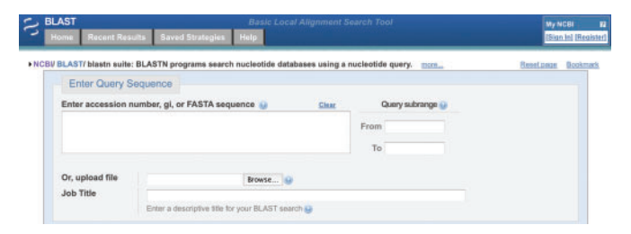
Figure 1. Query sequence section of nucleotide blast form. The blue header provides links to the NCBI home page (left-most double helix) as well as tabs that can take a user to the BLAST home page, recent search results for a user, strategies saved via My NCBI and a help directory. On the far right is the My NCBI sign in box. Immediately below the header on the left side are bread-crumbs for navigation. The top part of the form is common to the major BLAST pages. As shown, this is followed by a form allowing the user to enter his/her query sequence and associated data. See text for details.