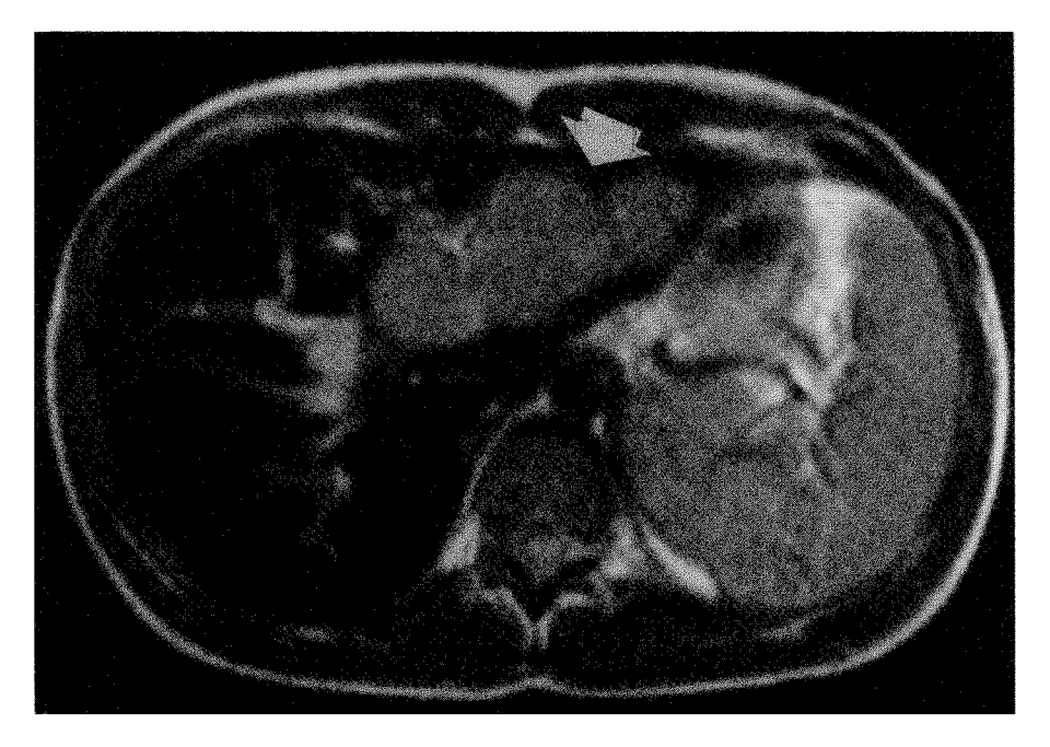
FIGURE 3 Abdominal MRI demonstrating marked dilatation of left biliary system up to the bifurcation (arrow). There are no signs of biliary stasis within the right liver.

bilio-plancreatic symptoms [5,6]. In our series cholangitis and epigastric pain were the predominant clinical features. Laboratory findings, although nonspecific, were useful in that they