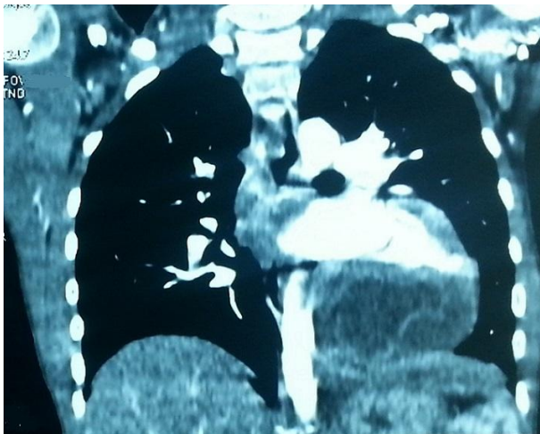
Figure 2: reconstructed coronal CT scan showing the same image of the pericardial cystic lesion next to the right ventricle