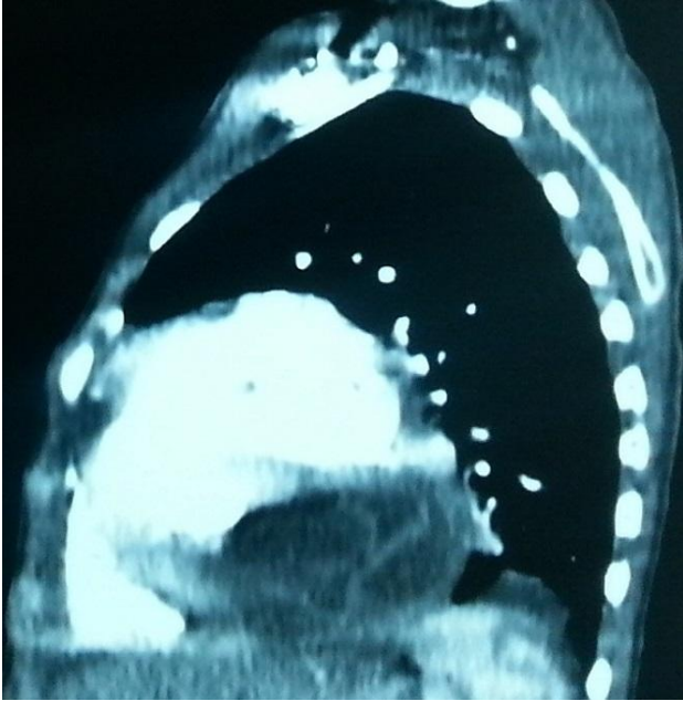
Figure 3: sagittal CT scan reconstructions after injection of contrast material in mediastinal view showing the same lesion next to right cavities with a detached layer within it