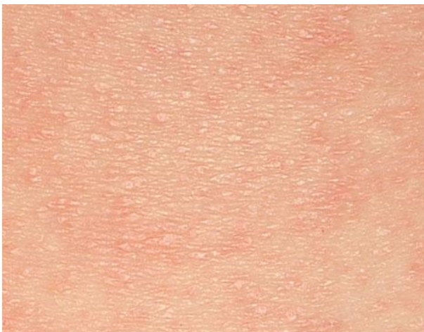
Fig. 2. Multiple, small, erythematous, flat-topped papules cover the entire surface of the body, sparing the head.