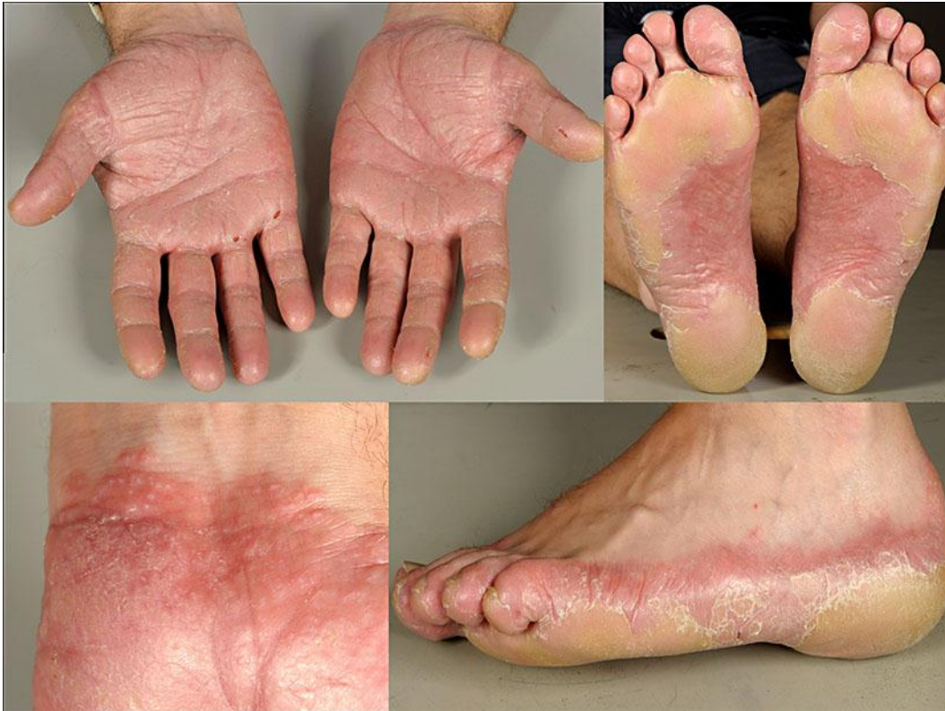
Fig. 1. Swollen palms and soles with thick, infiltrated hyperkeratotic plaques; at the borders red-violaceous, well-circumscribed papules are covered with superficial fine white lines.