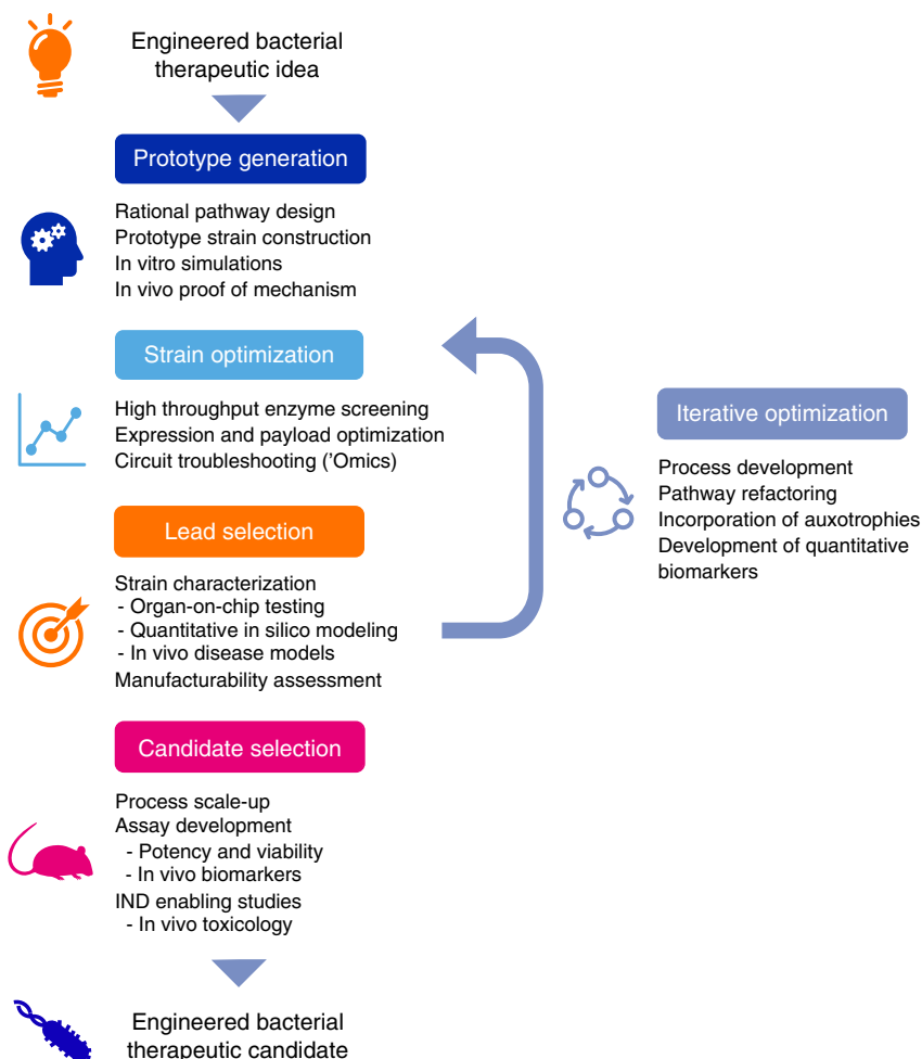
Fig. 2 Strategy for the development of engineered live bacterial therapeutic clinical candidates. Schematic representation of a workflow for developing clinical candidate-quality engineered strains. The development workflow should incorporate technologies for optimizing strain potency, as well as predictive in vitro and in vivo assays, as well quantitative pharmacology models, to maximize translational potential for patient populations.

Environmental conditions, including pH, oxygen concentration, and nutrient availability, are major determinants of strain viability and metabolism, and the first line of testing for engineered biotherapeutic organisms could utilize predictive, high throughput in vitro models that recapitulate the physiological conditions of the target environment. For example, methods that simulate the conditions of the human upper gastrointestinal tract, such as the simulated human intestinal microbial ecosystem (SHIME), are useful for characterizing the viability and function