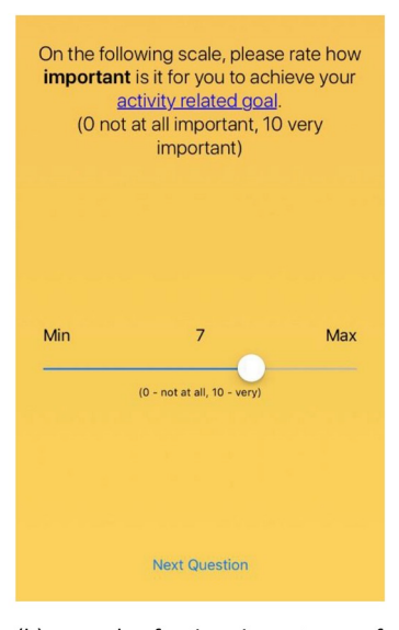
(b) example of rating importance of physical activity (module 2)