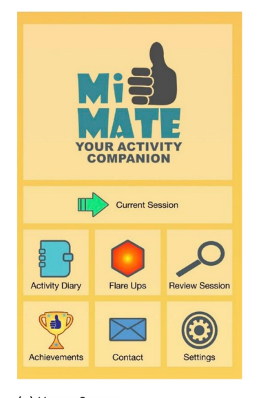
(a) Home Screen