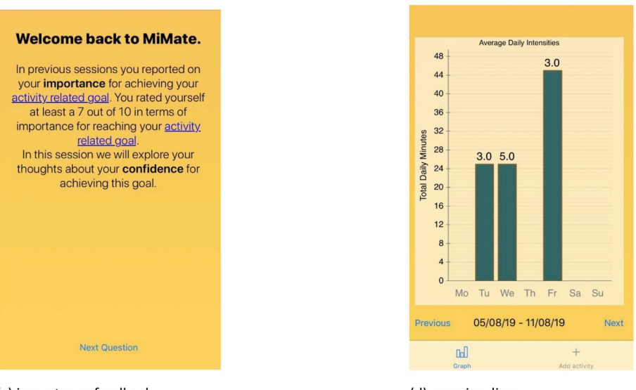
(c) importance feedback