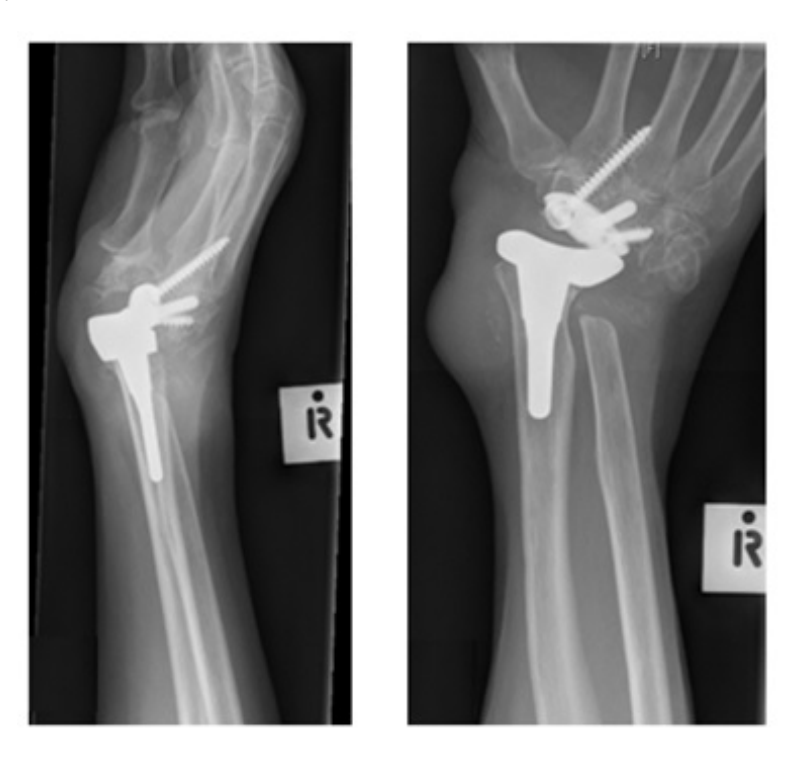
Fig. (9). Progression of arthroplasty at 24 months.

Despite the satisfactory radiological and clinical improvement, the patient went onto develop further migration of the distal component requiring a further revision. Unfortuantely, this did not resolve the issues relating to the migration of the prosthesis, thereby resulting in an eventual right wrist arthrodesis using an ulna bone graft in this patient (Fig. 11). Follow-up imaging has shown satisfactory bone healing and integration of the ulna graft at the fusion site at 9 months post-op (Fig. 12).