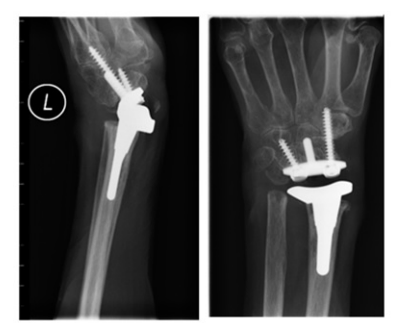
Fig. (2). Post-operative imaging following left total wrist replacement.

Initial management involved addressing symptoms within her dominant hand with the patient undergoing dorsal wrist synovectomy and EIP tendon transfer to address the ruptured EPL tendon. Whilst she recovered well from the above procedures, symptoms within the left hand continued to deteriorate with the patient developing profound neuropathic pain in the left side. Clinically, she was now exhibiting evidence of muscle wasting within the left forearm alongside inability to flex all digits with ongoing deformity of the wrist. Therefore a left total wrist replacement was undertaken to address these issues (Fig. 2).