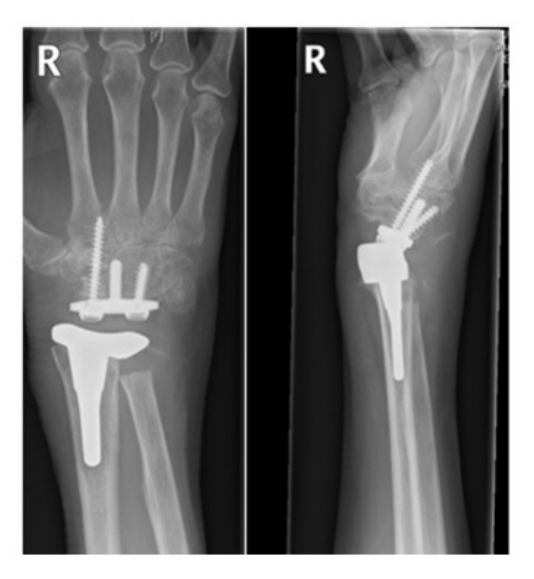
Fig. (8). Wrist arthroplasty at 2 months.