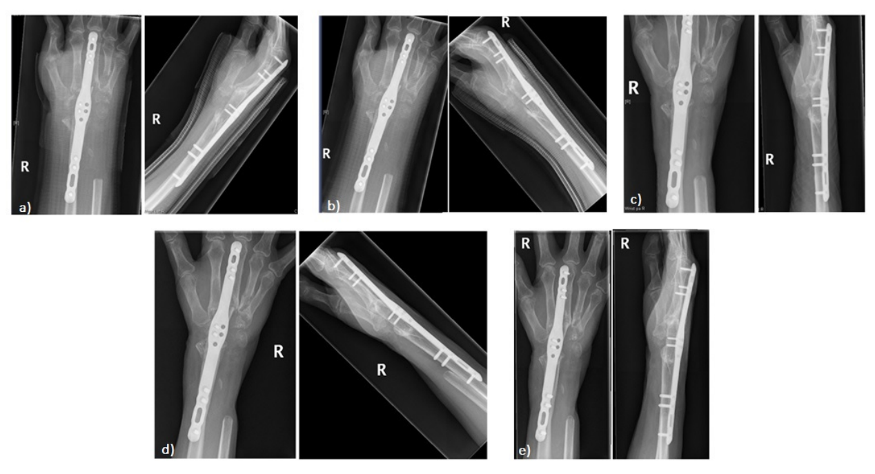
Fig. (12). Post-operative imaging at a) 1 month b) 2 months c) 4 months d) 6 months e) 9 months following arthrodesis with ulna graft showing satisfactory fusion with bone graft take.

Arthrodesis involves bridging of a fusion plate between the radius and its respective matacarpals, resulting in generalised reduction in the overall range of movement within the joint [9]. Whilst this is not ideal in healthy subjects, in those with debilitating disease, it enables fusion of the wrist in a position of function, which may in fact improve hand function and movement in the digits [9].