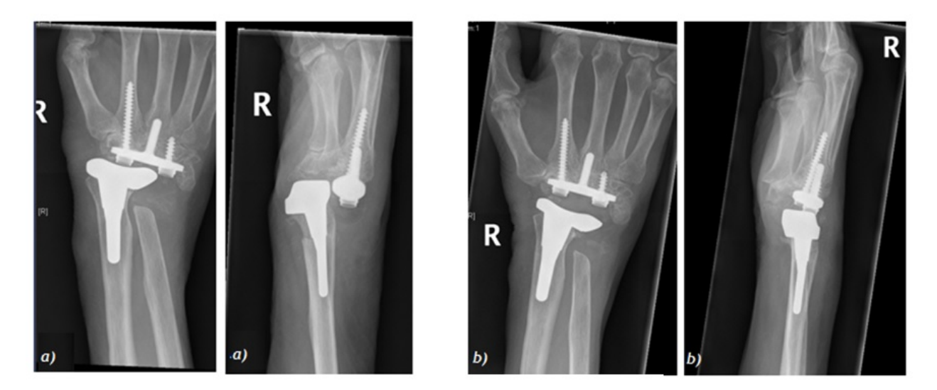
Fig. (10). Dorsal dislocation of wrist a) Pre-MUA b) Post- MUA.