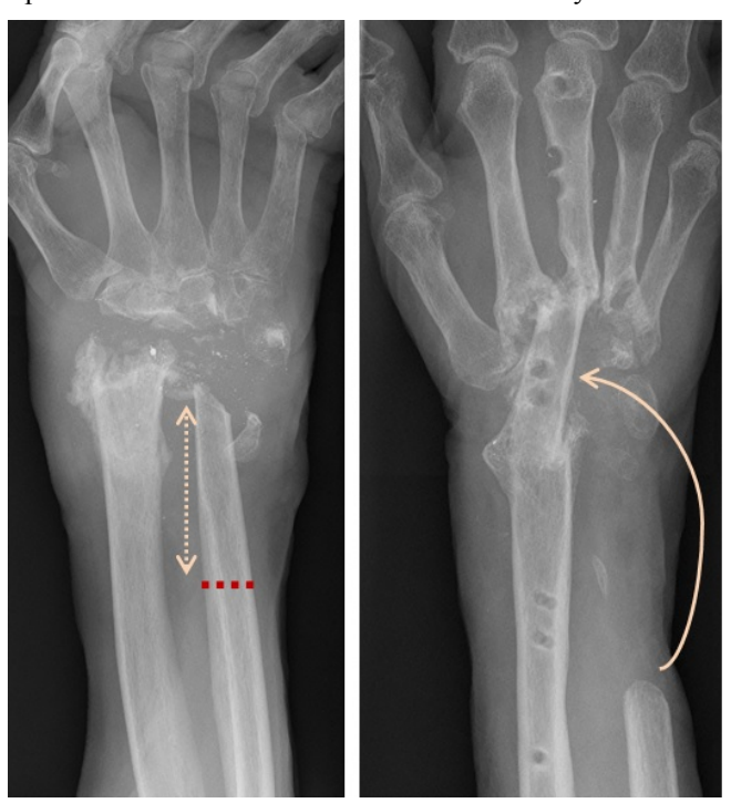
Fig. (1). Surgical technique.

The proximal attachments act as pivot to allow 180 degree rotation of the strut graft between the radius and metacarpal (Fig. 1). A standard fusion plate is fixed to the dorsum of the metacarpal, ulna graft and radial shaft using locking standard screws. A small volume of bone may also be used to provide additional packing at the proximal and distal ends of the strut graft. Repair of incised soft tissues are undertaken in layers.