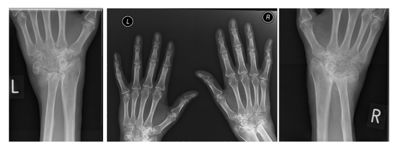
Fig. (6). Pre-operative imaging showing bilateral wrist joint disease.

A 68-year old right hand dominant psychotherapist with a background of RA, numerous previous tenosynovectomy procedures to both hands and FPL tendon reconstruction was referred to our unit with progressive bilateral wrist pain and deformity. Clinical and radiological evidence of severe RA was noted bilaterally with z-deformity at the wrists and ulnar translocation of the carpus on the radio-ulnar joints (Fig. 6).