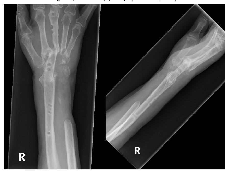
Fig. (5). Removal of fusion plate at 13 months.