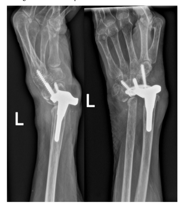
Fig. (3). Dislocated total wrist replacement.