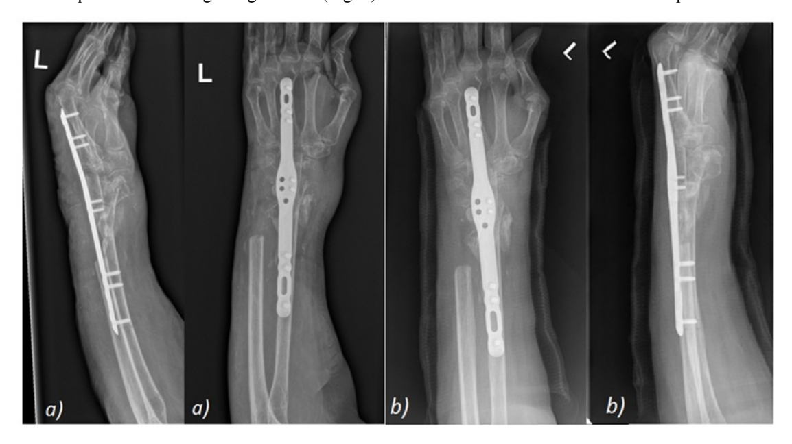
Fig. (4). Wrist arthrodesis with ulna strut graft a) immediately post-op b) 2 months post-op.

She progressed well post-operatively, with imaging at 2 months post-operatively illustrating evidence of graft take and bone healing. Approximately, 12 months following the arthrodesis, the patient's main complaint was prominence of the distal portion of the fusion plate and subsequent skin irritation. She subsequently underwent removal of the fusion plate at 13 month post-arthrodesis with intra-operative imaging and direct inspection of the fusion site showing evidence of complete bone healing and graft take (Fig. 5). She continues to remain under follow-up.