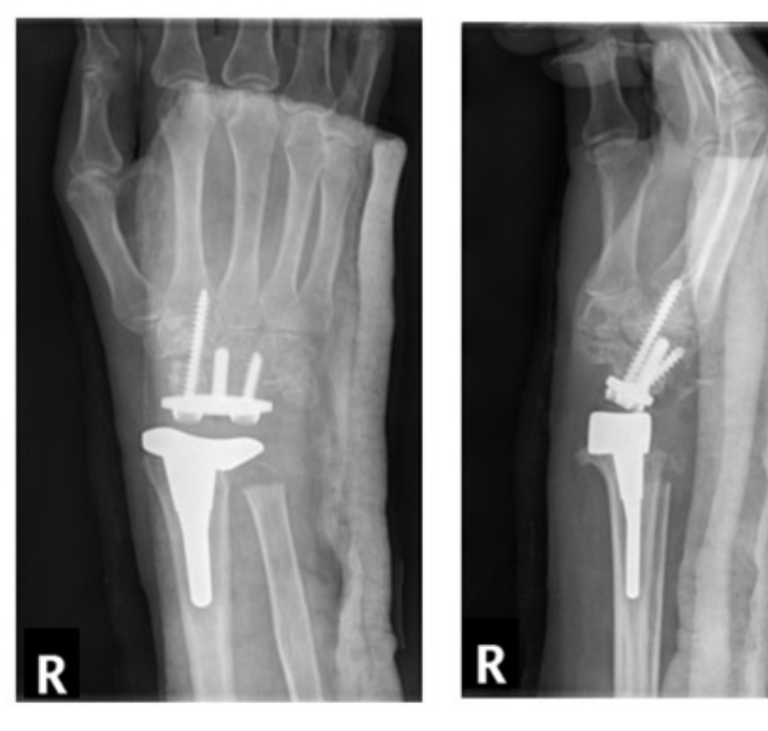
Fig. (7). Post wrist arthroplasty imaging.

A right wrist arthroplasty was undertaken (Fig. 7), with the patient demonstrating good post-operative function and ability to dorxsiflex and plantarflex to 50° and 10° at 2 months post-operatively (Fig. 8). Unfortunately, radiological evidence of dorsal progression of the distal prosthesis was evident at approximately 13 months post op, with the wrist replacement subluxing both clinically and radiologically at 24 months following the arthroplasty (Fig. 9). Subsequently, the patient underwent revision of the right wrist arthroplasty, however presented with dorsal dislocation of the wrist 1 month later requiring manipulation under anaesthesia (MUA), with a good range of movement with improved grip in the hand post MUA (Fig. 10).