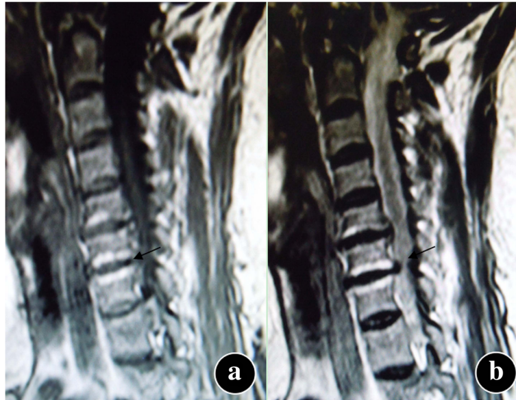
Fig. 1 Modic type I changes. Hemispheric low signal intensity on T1-weighted (a) and high signal intensity on T2-weighted (b) images are noted on both sides of the endplate at the C6–7 level in the cervical spine

6422 endplates, 70 (13.0%) patients and 88 (154 endplates or 2.4%) motion segments showed MC. Twenty (3.7%) cases and 27 (51 endplates or 0.8%) motion segments were type I; 41 (7.6%) cases and 43 (77 endplates or 1.2%) motion segments were type II; and 9 (1.7%) cases and 18 (26 endplates or 0.4%) motion segments were type III. According to the occurrence of MC in different intervertebral disc segments, 0 (0%) lesions involved C2–3, 9 (0.3%) involved C3–4, 20 (0.6%) involved C4–5, 29 (0.