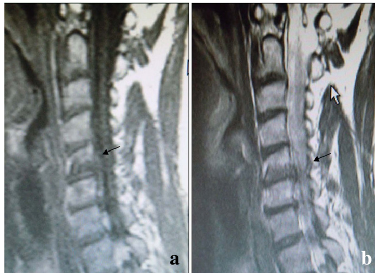
Fig. 3 Modic type III changes. Hemispheric low signal intensity on T1-weighted (a) and T2-weighted (b) images is noted on the upper endplate at the C5–6 level in the cervical spine