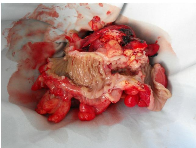
Fig. 2. Intestinal lumen narrowed by the tumor.