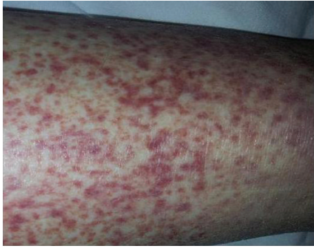
FIGURE 2: Cutaneous leukocytoclastic rash.

long segments in the jejunal loops, multiple lymphadenopathy (the largest was 2 cm), and bilateral chronic sacroiliitis. Since colonoscopy and biopsy results were compatible with Crohn's disease, treatment was started with methyl prednisolone (60 mg/day), ciprofloxacin (1000 mg/day), and metronidazole (1500 mg/day). During followup, both WBC ( 15 \times 10^3/\mu\text{L} ) and CRP (7 mg/dL) decreased, but skin rashes on the lower extremity did not disappear, and the skin biopsy of the patient showed LV. Secondary reasons for LV such as drug use, infection, and additional diseases were investigated, but none of them was found, so LV was considered to be secondary to inflammatory bowel disease (Crohn's disease).