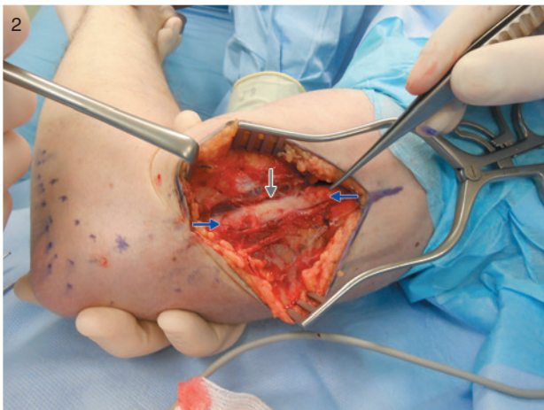
Figure 2: Intraoperative situs during surgical exploration of the patient's right ulnar nerve. Incision of the right arm between the distal bicipital sulcus and the cubital tunnel. The ulnar nerve appears distended (gray arrow) and entrapped in inflammatory tissue (blue arrows).

Especially, histopathologic details directed the attention to eosinophilic fasciitis as a potential underlying disease. This rare systemic disease was reported in the first instance by Shulman in 1984 [1]. He diagnosed a diffuse fasciitis resulting in sclerodermiform skin indurations and joint contractures accompanied by hypergammaglobulinemia and the name-giving eosinophilia in the blood.