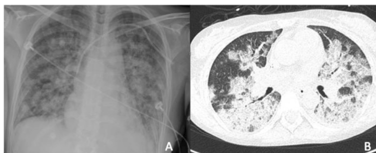
Figure 1 Chest X-ray and CT scan. (A) Chest X-ray where bilateral pulmonary infiltrates were observed. (B) Computed axial tomography (CT) scan where mixed basal pulmonary infiltrates and alveolar collapse were observed. Images were taken at the time of admission (day 1).

Bronchoscopy has been recommended in the case of suspicion of DAH in which clinical presentation is atypical, as it confirms the diagnosis. In subacute cases, methods such as the quantitative score of hemosiderin-laden macrophages in the BAL fluid sample or increased red blood cell counts are used [6]. Hemosiderin, a breakdown product of