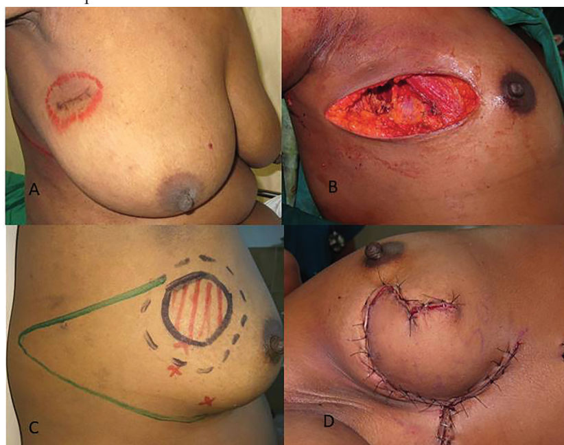
Fig. 2: A. Scar of excision biopsy for a right breast lump at a primary center with margin status unknown. B. Defect after excision of tumor along with overlying skin. C. Pre-operative marking of The LTDF flap. D. Final result after the LTDF flap has been transposed to provide skin as well as soft tissue coverage.