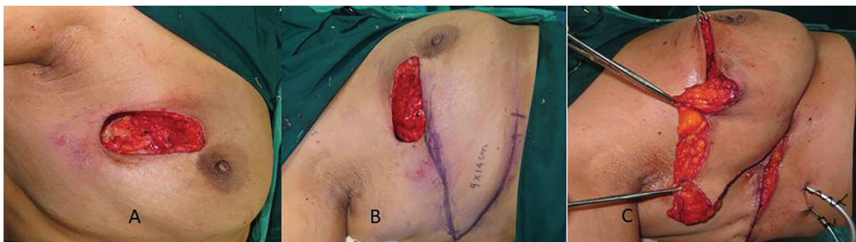
Fig. 1: A. The defect after the tumor is resected as per oncological principles. Skin is not involved. B. A wedge shaped lateral thoracodorsal flap is marked with the infra-mammary fold forming its axis. C. The flap is advanced, the skin de-epithelialized to provide bulk to the defect.

Extra care is taken not to breach the fascia at the junction of latissimus dorsi and serratus anterior muscle. The flap was transposed in the defect and the symmetry of mound