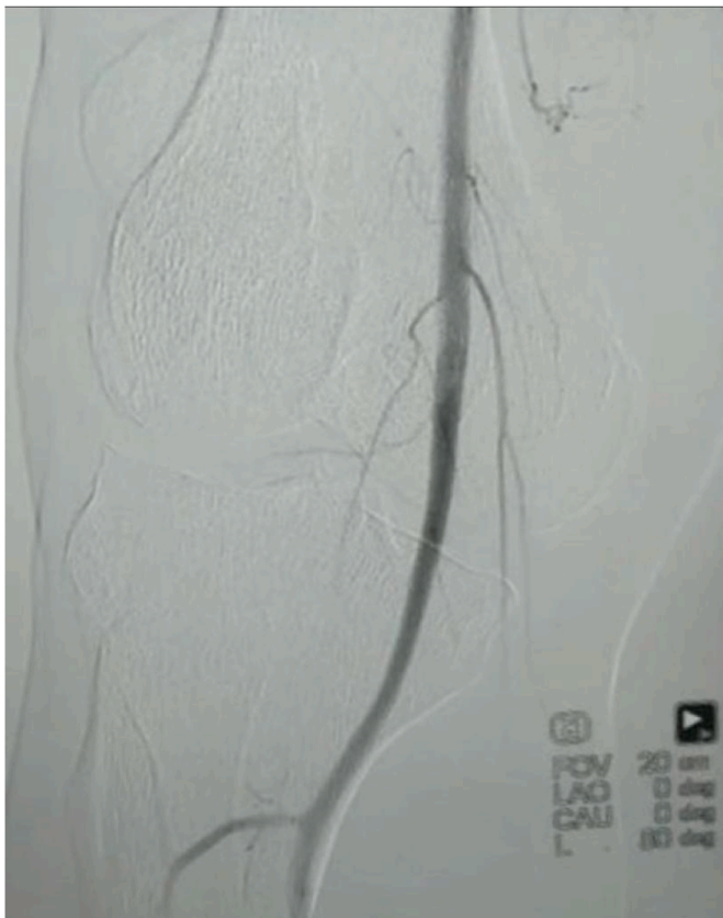
Fig. 1. arteriography frontal section showing a femoropopliteal axis without abnormalities.