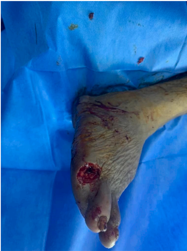
Fig. 4. amputation of the fifth toe with satisfactory bleeding.

lesions without proximal lesions or embolism. Since the cannabis was the only causative factor found in this patient, we retained the diagnosis of cannabis arteritis.