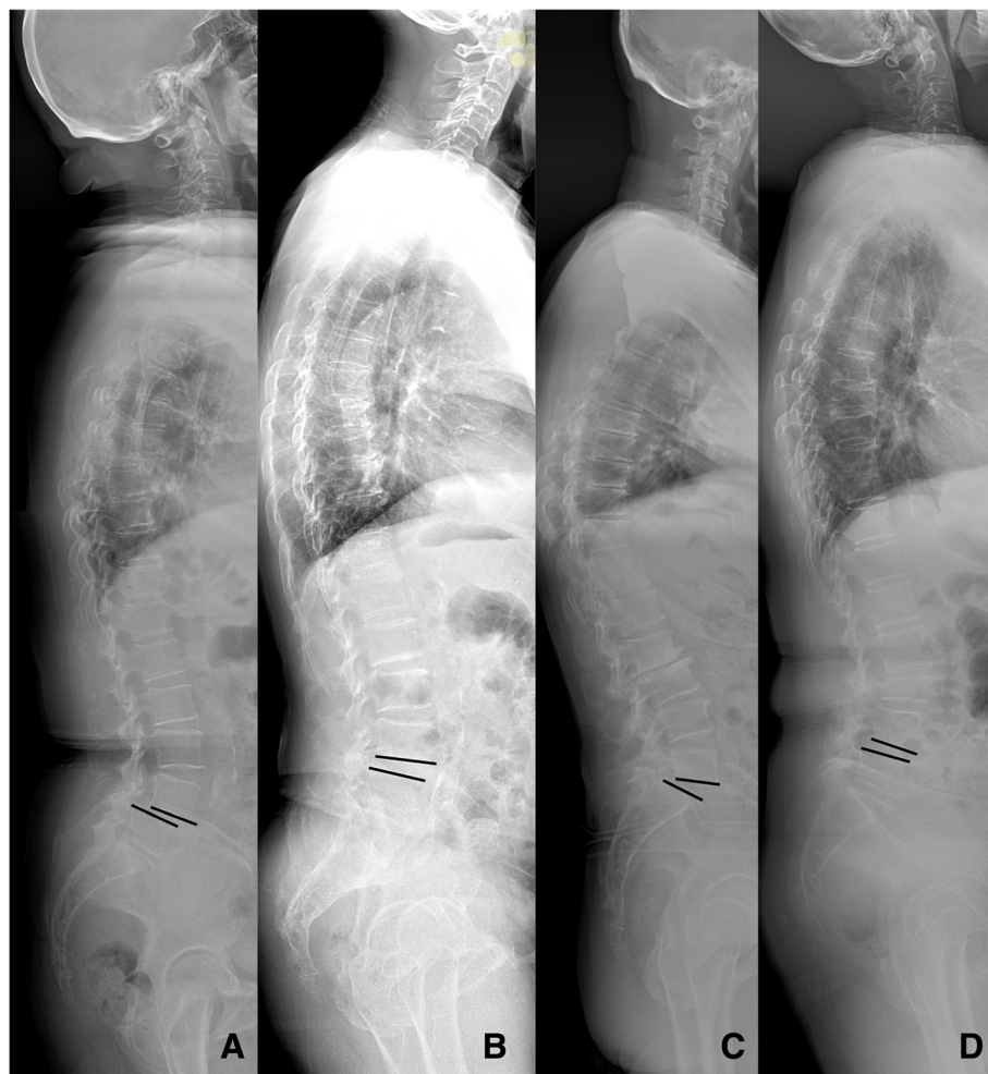
Fig. 1 Diagram of the CARDS classification. a Type A, advanced disc space collapse at L4/5 without kyphosis; b Type B, disc height partially preserved with translation less than 5 mm; c Type C, disc height partially preserved with translation more than 5 mm; d Type D, kyphotic alignment at L4/5

Patients data were recorded as age, sex, and body mass index (BMI). Clinical outcome measures used were the visual analog scale (VAS), Oswestry Disability Index (ODI), and the 36-Item Short Form Health Survey (SF-36). Clinical data were collected before surgery and 1 year after surgery by independent assessors.