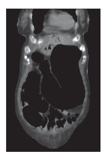
Figure 1: Saggittal section of the abdomen showing severe gastric and intestinal dilatation

HPVG is most often confused with pneumobilia viz. gas in the hepato-biliary tree. The pattern of air in HPVG has been described as that extending to within 2 cm of the liver capsule as seen in Figure 2, while the air in the biliary tract remains central around the portal hilum and does not extend to within 2 cm of the liver capsule. The gas in the biliary tree moves towards the portahepatis by the centripetal force of the bile and appears central in the liver, while that in HPVG travels peripherally caused by the centrifugal flow of blood. HPVG is commonly associated with intramural bowel gas called pneumatosis intestinalis, which may be secondary to necrotic bowel. It is characterized by thin, continuous, crescenteric radiolucency with in the distended bowel wall. Although the pathophysiology and mechanism of HPVG are not well understood, the factors associated with it include bowel distension with mucosal damage, sepsis, and gas embolization.<sup>[6]</sup> It is hypothesised that the gas enters the