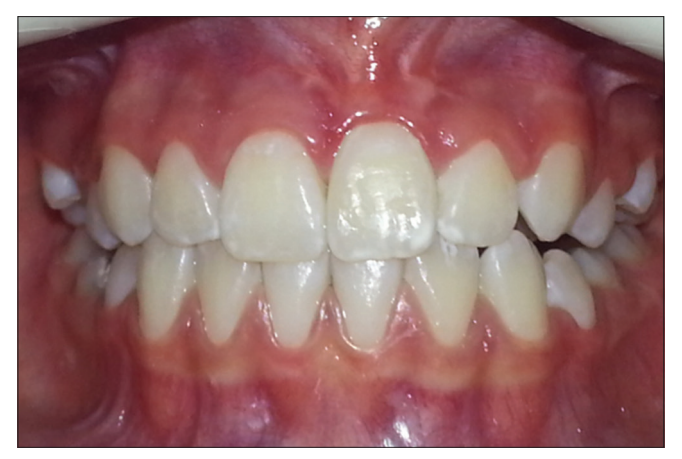
Figure 6: Fifteen months follow up intraoral photographs.

The aim of treatment of impacted tooth is a proper alignment in the dental arch, in a stable position, with a sufficient keratinized gingiva. The surgical and orthodontic technique allows the traction of the impacted teeth to the correct position in the alveolar ridge.<sup>[10]</sup>