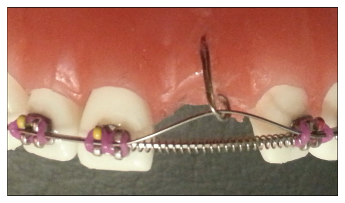
Figure 4: Orthodontic traction with a 0.014 nickal–titanium wire as elastic overlay on stiff base arch wire.

It is strongly recommended that all teeth that have not erupted 6 months after the normal eruption time should be examined radiographically to assess any possible cause for the delayed eruption.<sup>[12]</sup> Early diagnosis and interception in these cases is the best approach for their management.<sup>[4]</sup> When more than three-fourth of root is completed and the tooth does not emerge to oral cavity, it can be considered as impacted, especially if its antimere has erupted more than 6 months ago. The longer impaction time, the weaker prognosis is expected.[4] Evaluation of mechanotherapy possibilities to provide enough space and anchorage should be considered when forced eruption is planned. In this case, presence of teeth #11 and #22 can act as anchorage for extrusion of tooth #21. The early interception permits the epithelial root sheath to be redirected and offers the chance for the developing root to adapt to the correct spatial relationship of the aligned crown.<sup>[4]</sup>