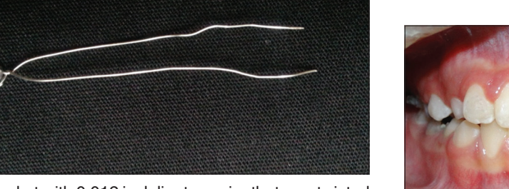
Figure 3: Bracket with 0.012 inch ligature wire that was twisted around the wings.