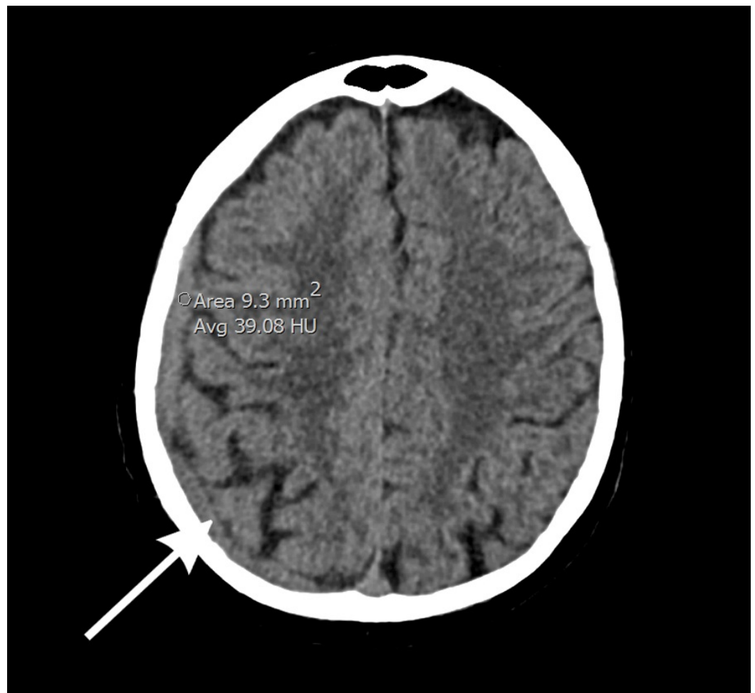
FIGURE 1: Computed tomography (CT) of the head shows a diffuse, enhancing dural thickening overlying the right hemisphere with focal areas of nodularity, suggestive of metastatic disease

Blood tests performed on his presentation to emergency revealed a PSA of 93. Full blood count and electrolytes were normal. Computed tomography (CT) of the head was performed which showed a diffuse enhancing dural thickening overlying the right hemisphere with focal areas of nodularity suggestive of metastatic disease. There was an associated mass effect with effacement of the right lateral ventricle and 6 mm of left-sided midline shift (Figure 1). This was believed to be unlikely due to a subdural hematoma, given the enhancement, and metastatic disease was thought to be more likely with his history. He then underwent magnetic resonance imaging (MRI) with gadolinium contrast which showed pachymeningeal metastatic disease overlying the right cerebral convexity, associated with metastatic marrow infiltration of the overlying calvarium and a small extracranial component. A leptomeningeal extension was also evident at the right frontoparietal junction (Figure 2).