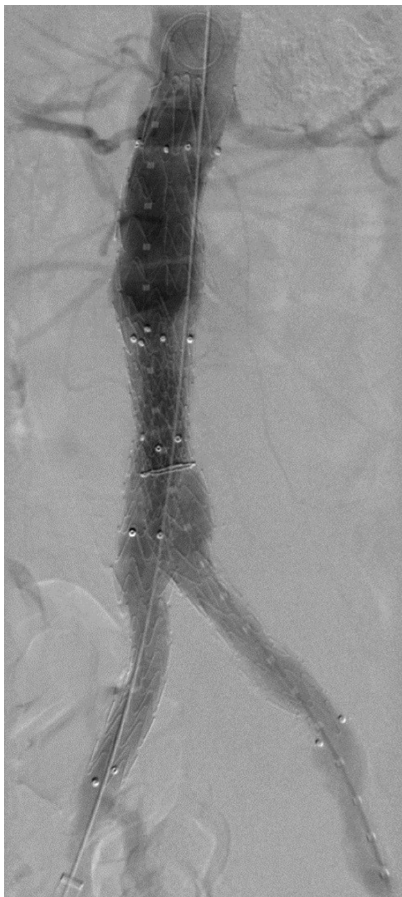
Fig 2. Intraoperative angiogram showing successful endovascular aortic repair and exclusion of aneurysm.

shields or N95 masks were worn, allowing health care workers to potentially have been exposed. The lack of uniform testing across institutions suggests that special