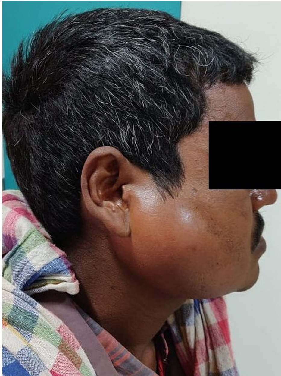
FIGURE 1: Clinical Image

An ill-defined swelling over the right parotid region.