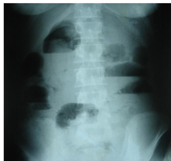
Figure 2 Upright plain abdominal X-ray demonstrating a small bowel obstruction. Note the presence of multiple air fluid levels.

Although rare, a trichobezoar may present as an emergency that requires proper preparation by the surgeons. Due to the unavailability of endoscopy and computed