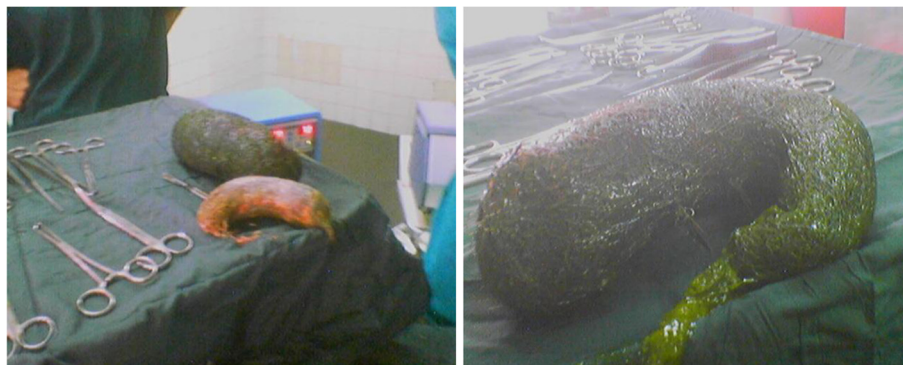
Figure 4 Removal of trichobezoar revealed two masses taking the shape of the stomach and ileum.

In one study, a laparoscopy was used for the initial procedure but then converted into a laparotomy when difficulties were encountered as a result of a large intra-gastric mass. In some centers, laparoscopy is considered inferior to laparotomy for the treatment of a trichobezoar. Nirasawa et al. [10] were the first to report on laparoscopic removal of a trichobezoar. Since then, only six other reports of attempted laparoscopic removal have been published [7-9,11-13]. The lack of reports on endoscopic treatment might partly be explained by the rarity