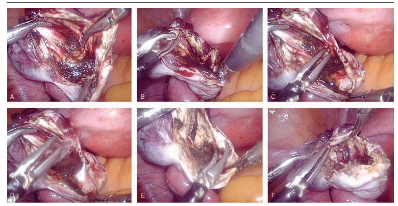
Figure 2. Laparoscopic endometrioma drainage and ablation with bipolar coagulation. (A) Drainage, irrigation, and inspection of the internal wall. (B) A 1-cm × 1cm biopsy of the cyst wall is obtained for histological examination. (C) Coagulating the cyst lining systematically using bipolar forceps at 30 W. (D) The ovary is cooled frequently using irrigation fluid. (E) Coagulating the whole internal wall with very short-duration ablation times until the color of the cyst wall changes to yellowishwhite without damaging the adjacent ovarian tissue. (F) When mild redness of the internal wall returns shortly after ablation, the appropriate depth of destruction of the endometrioma has been achieved.

leads to inadvertent removal of some surrounding ovarian cortex, especially when the lesion is near the hilus, which was confirmed by histological studies.<sup>[7,16]</sup> In addition, hemostasis of the ovarian tissue after excision requires using energy equipment, which has a negative impact on the ovarian blood supply, especially when the bleeding is close to the hilus.<sup>[6,17]</sup>