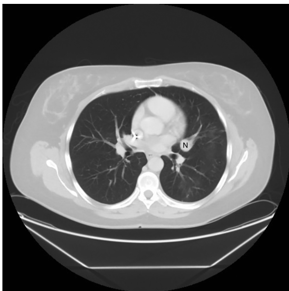
Figure 2. One-month post-bronchoscopy axial computerized imaging showing lung nodule (labelled N) near complete resolution of the lung opacities.

OP is a type of interstitial lung disease that affects the distal bronchioles, respiratory bronchioles, alveolar ducts