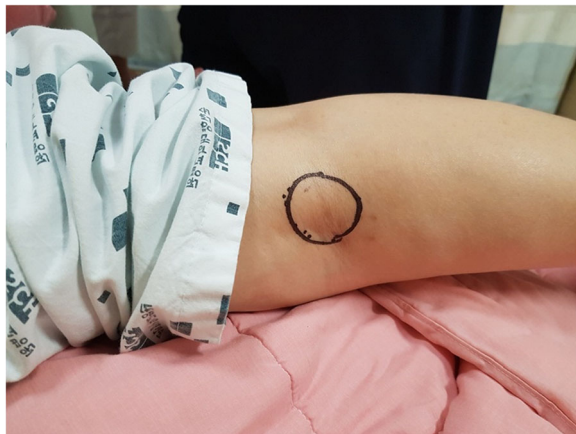
Fig. 1 A clinical photograph taken on admission showing mild swelling over the popliteal area

Arthroscopy was performed through anterolateral and anteromedial portals with the patient in the supine position. A 1.5 \times 1.5 -cm osteochondral defect on the medial femoral condyle, and knee inflammation, were evident. We thus performed arthroscopic microfracture and synovectomy. Open excision was chosen because we were unable to find the orifice of the Baker's cyst at arthroscopy. The patient was then placed in the prone position and the