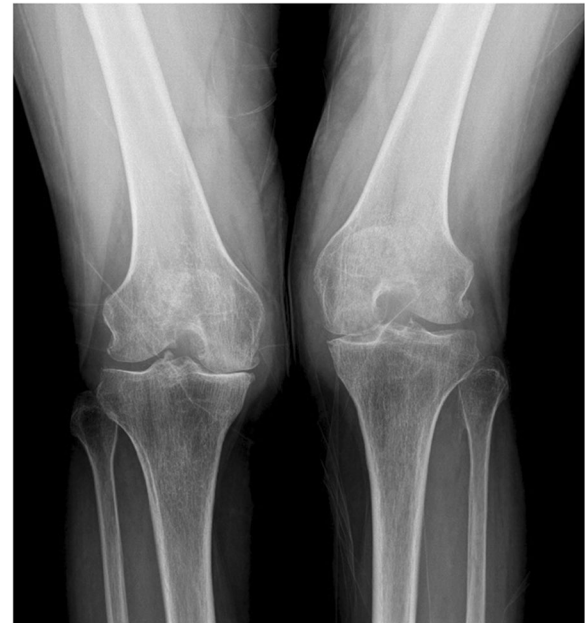
Fig. 2 A plain radiograph showing severe osteoarthritis with joint-space narrowing, osteophyte formation, and sclerosis

Baker's cyst excised. A curvilinear skin incision was created in the popliteal area and dissection was performed between the semimembranosus muscle and the medial head of the gastrocnemius muscle. Granulation tissue scattered around the cystic mass was removed. During cyst excision, the cyst tore and yellowish pus-like material flowed out (Fig. 4). Intraoperative culture tests were negative. Histological examination revealed acute and chronic nonspecific inflammation, granulation tissue formation and fibrin deposition. The patient was treated postoperatively with a first-generation cephalosporin (cefazolin) because the organism most commonly causing Baker's cyst infection is Staphylococcus aureus [2]. The symptoms had improved 6 weeks after surgery.