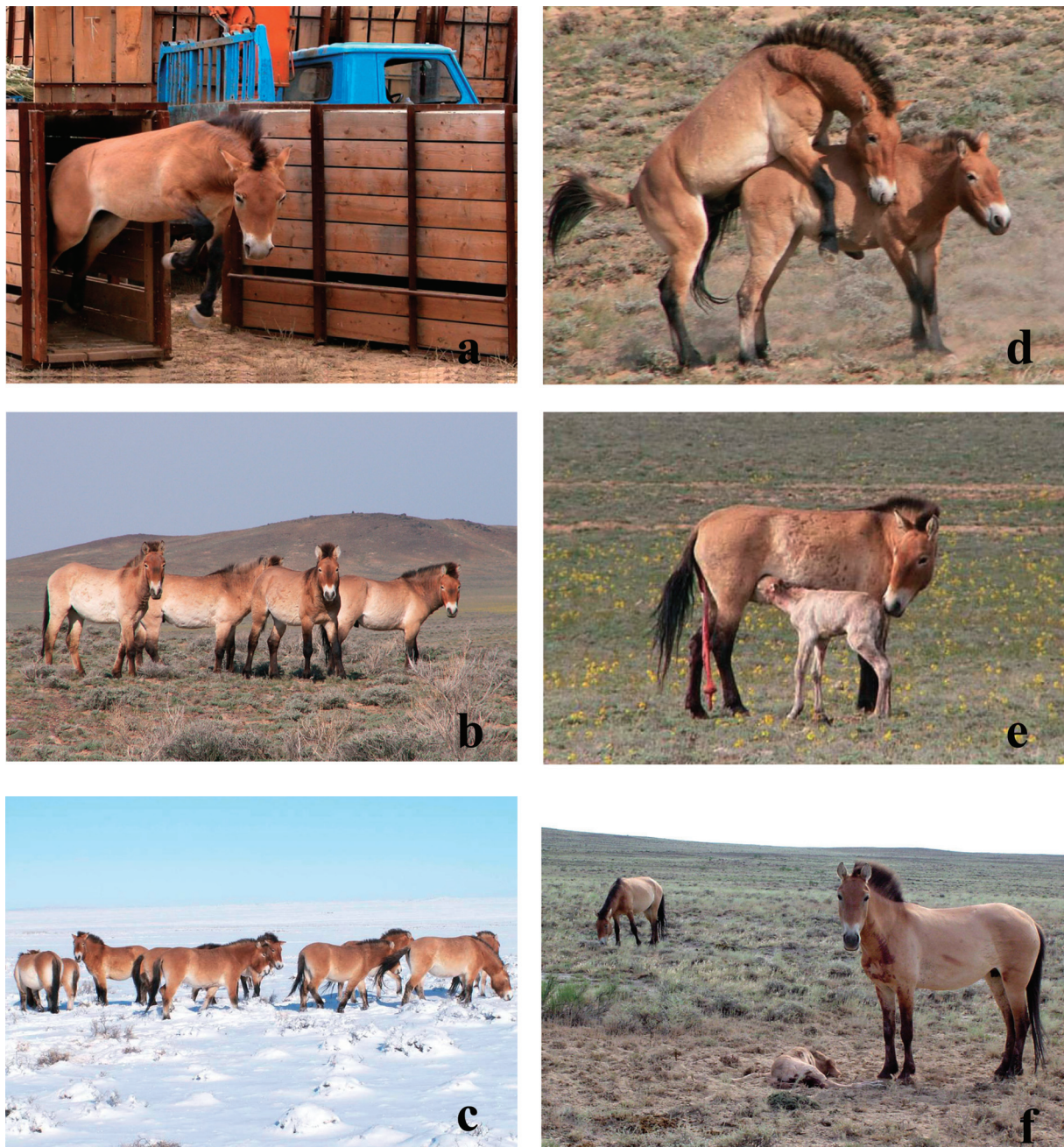
Fig. 1. The released Przewalski's horses ( Equus przewalskii ) in Xinjiang, China. The first Przewalski's horse was being released into the wild on August, 2001 (a). A group of released Przewalski's horses in summer (b) and winter (c) in the wild condition. Mating behavior was observed in the breeding season (from May to September) (d). A Przewalski's horse gave birth to her baby (e). A foal was killed by the leading stallion on her birthday (f).

(Fig. 1f). Nine adult mares gave birth to seven foals (3 male/4 female) during this year, and three foals were killed by the leading stallion, and one died from malnutrition at five month of age. Three female foals