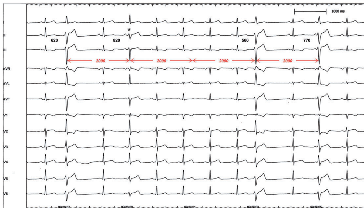
Figure 1 12-lead electrocardiogram with monofocal premature ventricular contractions showing a small R-wave in V 1 and left anterior hemiblock pattern (left axis deviation, rS in inferior leads, qR in aVL). The premature ventricular contractions have completely different ‘coupling’ intervals but identical interectopic intervals (2000 ms) revealing the basal rate of a parasystolic focus (the third parasystolic beat being concealed). Simultaneous activation by parasystole and sinus rhythm (note preceding p-wave) results in a fusion beat (*).

Catheter ablation was proposed to the patient and her family, and they consented to an interventional strategy. Using a transseptal access guided by intracardiac echocardiography and a 3D mapping system (CARTO 3 with PaSo module, Biosense Webster, Diamond Bar, CA, USA), we performed activation- and pacemapping of the ectopic focus. The earliest activation (-50 ms pre-QRS) with a unipolar qs signal was located in the LPF area at the posterior septum and was effectively targeted by ablation ( Figure 3A ). An internal loop-recorder (ILR) was implanted in order to monitor ablation success and to rule out other causes of syncope. After an uneventful course of more than 2 years and absence of parasystole on Holter and ILR