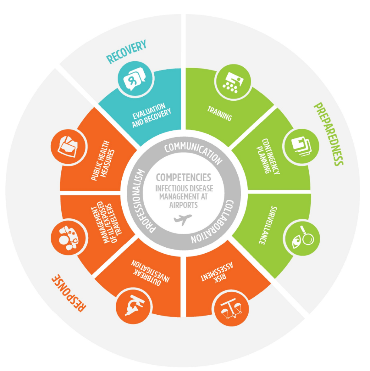
Fig 2. Framework of the competency profile for infectious disease management at airports. Own compilation.

https://doi.org/10.1371/journal.pone.0233360.g002