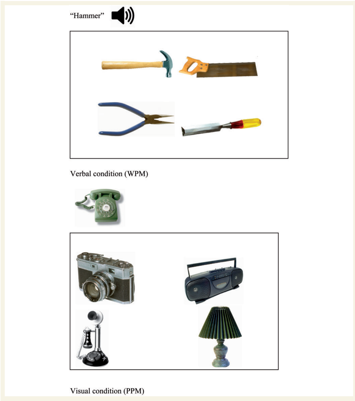
Figure 2 Examples of trials used in the cyclical item matching task. PPM = Picture-Picture matching; WPM = Word-Picture matching.

have a relatively stable impact across trials. In addition, many of the patients with semantic aphasia reported here were previously shown to (i) have unchanging performance across cycles for blocks of semantically unrelated items in the same paradigm; and (ii) declining picture naming performance across cycles—even though visual search