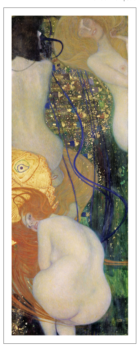
Figure 2. Goldfish, 1901–1902 by Gustav Klimt. Originally entitled To my detractors, Goldfish reflects Klimt's response to the criticisms he received for Philosophy and Medicine .