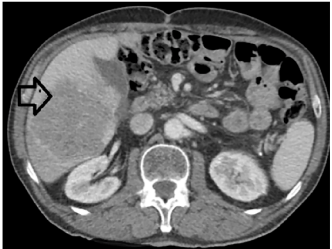
FIGURE 1: Computed Tomography Image Revealing a Single Liver Metastasis, Located in Segments 5 and 6 of the Liver

A 63-year-old male patient with an Eastern Cooperative Oncology Group index of 1 was referred to our hospital for a single, large liver metastasis, twelve months after a radical total gastrectomy and DII lymphadenectomy for upper third gastric adenocarcinoma. The initial pathology report identified a pT3N1M0LV1, moderate-differentiated, gastric adenocarcinoma. As an adjuvant treatment, the patient received 12 cycles of FOLFOX chemotherapy. During the present admission, the abdominal computed tomography (CT) revealed a unique liver metastasis located in the segments 5 and 6, of 105/85 mm in diameter (Figure 1).