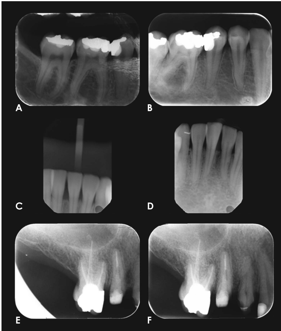
Fig. 2. A. A periapical image of the mandibular premolar-molar area obtained with a damaged (partial stripping and peeled surface) PSP. B. Final periapical image obtained with an undamaged PSP after retake. C. Motion artifact observed in an image obtained with CMOS. D. Mandibular incisor periapical radiography after a retake using CMOS. E. Cone-cut error that occurred due to misalignment of the position-indicating device with the PSP plate. F. Final periapical image obtained by accurate alignment of the position-indicating device with the PSP plate without a cone-cut after retake. CMOS: complementary metal-oxide semiconductor, PSP: photostimulable phosphor.

real-time imaging. The GXS-700 CMOS sensor offers 2.4 million pixels, a pixel size of 19.5 \mu\text{m} \times 19.5 \mu\text{m} and a theoretical resolution of 25.6 lp/mm. In vivo imaging was performed using standardized paralleling technique equipment with round collimation (Rinn Manufacturing Company, Elgin, IL, USA) with a focus-receptor distance of 20 cm and an image-exposure time ranging between 0.01 s and 0.08 s, for both detectors depending on tooth-, bone-, and patient-related factors. The periapical and bitewing radiographs were analyzed using SiSoft Medical software (Park Ridge, New Jersey, USA) on a 21.3-inch flat-panel monitor (NEC MultiSync, Munchen, Germany) with 2,048 \times 2,560 pixel resolution, in a dimly lit room. Pulpal root canal, dentin, and enamel visibility were used as indicators of optimal image quality, as determined by the consensus of researchers involved in the study.