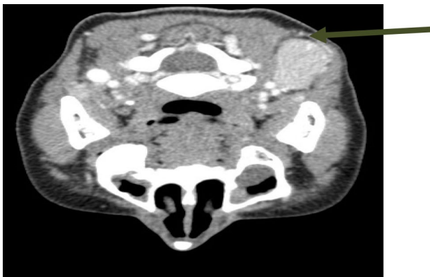
Fig. 1 The enlarged lymph nodes on axial plane with CECT imaging as shown by the arrow

However, due to COVID-19 pandemic much of the patient follow-up was interrupted, but still patient was conservatively managed and fever was managed by paracetamol, an acetaminophen in SOS basis and Augmentin (co-amoxiclav and clavulanic acid) 675 mg OD was prescribed for initial 5 days.