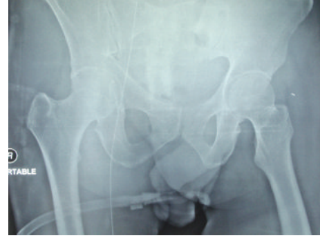
FIGURE 3: Pelvic X-ray showing the guidewire extending into the femoral vein in the right thigh.