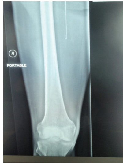
FIGURE 4: Right thigh X-ray showing the J-tip of the lost guidewire medial to the femur.

catheter,” and “complications” in various combinations. Studies and case reports written in English as well as their listed references were reviewed for pertinent data.