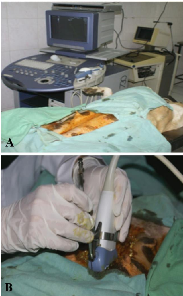
Fig. 1. A) Voluson 730 PRO, GE unit with a multifrequency (5.00-8.00 MHz) convex transducer. B) Transabdominal approach, an external guide was attached to the transducer and held by the operator. Under direct visualization, a spinal needle (22-gauge) was introduced into the thorax of the most accessible fetus.

were avoided. The needle tip was placed directly into the fetal heart and 200.00 \mu\text{L} of potassium chloride (KCL; 2.00 mEq \text{mL}^{-1} , Institute Pasteur, Tehran, Iran) was inoculated to cease the cardiac activity. The dosage of injected potassium chloride was simulated by human fields based on previously published articles. 20-22 When the cardiac arrest was observed for 60 sec, the needle was withdrawn. The procedure was repeated for two additional fetuses. To have an opportunity to simultaneously assess the possibility of a selective fetal reduction in the bitches, no more than three fetuses were reduced. After the procedure, all patients underwent a repeat scanning. If the cardiac activity was observed in a fetus subjected to a termination procedure, the procedure was repeated. If any of the animals did not abort and live fetuses were observed on ultrasound scans after 72 hr, the procedure was repeated on more fetuses.