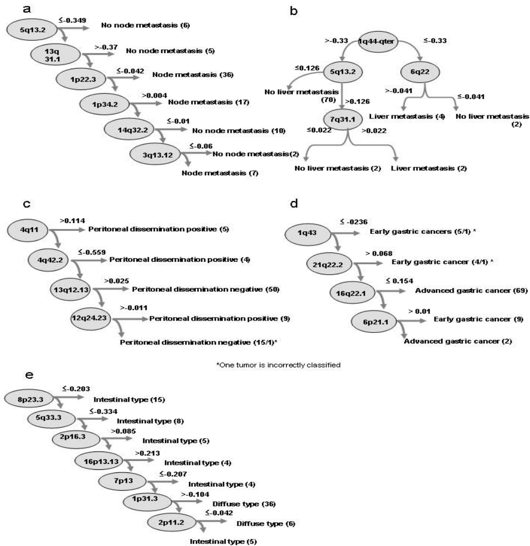
Figure 2 Identification of BAC clones by a decision-tree algorithm to classify the gastric cancers into two groups with different characters. (a) Differentiation between gastric cancers with and without node metastasis. These two groups can be clearly differentiated by examining the degree of the copy number changes of six BAC clones mapped to 5q13.2, 13q31.1, 1p22.3, 1p34.2, 14q32.2, and 3q13.12 in descending order. A tumor of which the copy number at 5q13.2 was \leq -0.346 ( \log_2 ) shows no node metastasis. When the DNA copy number of the tumor was not the case at the first clone, the second criterion ( > -0.37 at 13q31.1) was checked. Five tumors were separated from the remaining 77 tumors at this point. When the DNA copy number of the clone at 13q31.1 was \leq 0.37 in the tumor, the third clone located on 1p22.3 was examined. If the DNA copy number of the tumor meets the criterion of the third clone, \leq -0.042 , nodal metastasis was positive in this tumor. Thirty-six cancers were classified into this category at this point. In this way, the DNA copy number of the tumor was in turn examined from the first to the sixth clone. Each step successively sorts a cluster of either group. Eventually, all gastric cancers were classified into either of two groups, cancers with and without node metastasis. The figures in parentheses indicate the number of tumors fitting the requirements. The correctly classified instances were 83 (100%), and the incorrectly classified instances were 0 (0%). In this classifier, the number of leaves is seven, and the size of the tree was 13. In the same way as the case of node metastasis, BAC clones and their copy numbers were determined for liver metastasis (b), peritoneal dissemination (c), depth of tumor invasion (early or advanced cancer)(d), and histologic type (e).