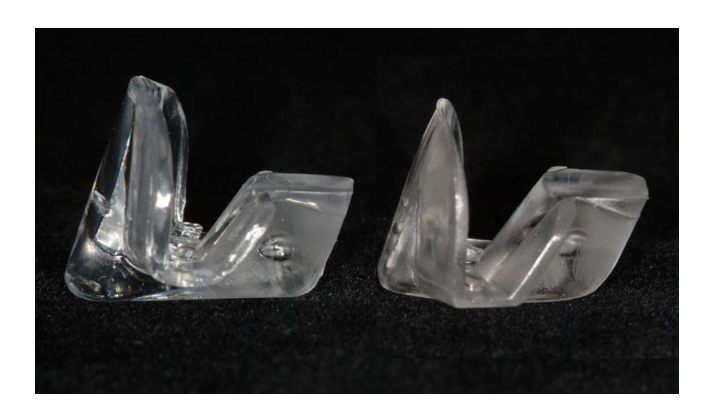
Figure I The NTI-tss device, standard type (left) and vertically reduced type (right).

Conversely, some renowned clinical researchers [e.g., [8-12]] have tempered over-optimistic expectations by raising doubts on the claimed success and by pointing at the