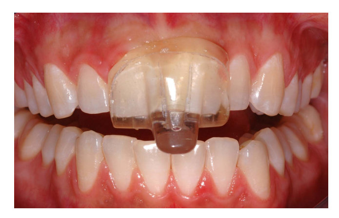
Figure 2 Inserted NTI-tss device.

possibility of unwanted side effects, such as aspiration, ingestion, occlusal changes after prolonged unmonitored use, and mobility of anterior teeth. In 2003, Helkimo [8] delivered an expert statement on demand of the Swedish Dental Association and the Swedish National Board of Health and Welfare on the question whether the use of the NTI-tss device "is to be regarded as lege artis and according to science and empirical experience, both as to the treatment of stomatognathic problems as well as migraine." The author came to the conclusion that there is a "total lack of scientific documentation of its therapeutic effects and possible unwanted side-effects" [8]. As far as side effects are concerned, Jokstad et al [10] mentioned that one person in Norway [13] and three individuals in the United States were subjected to medical emergencies due to aspirated NTI-tss devices splints. For the three cases from the U.S., the author referred to the FDA's Manufacturer and User Facility Device Experience Database (MAUDE), which contains voluntary, user facility, distributor, and manufacturer reports of adverse events involving medical devices. Later, Wright and Jundt [12] repeated the contention of four aspirated NTI-tss devices by referring Jokstad et al's article [10].